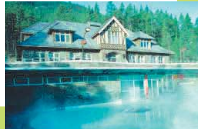
The Banff Upper Hot Springs bathhouse and pool as they look today.

In 1883, three men were working on the new railway line near Banff. They found a cave with hot springs inside. The First Nations people in the area had known about this cave for a long time. The three workers made a big fuss about it, though, and thought they could build a resort there and make a lot of money. However, the government of Canada decided the land would be national property. And so Banff became Canada's first national park.