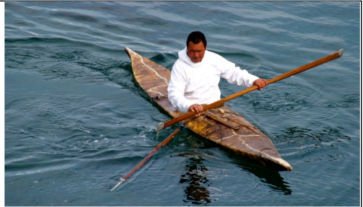
Inuit seal hunter in a kayak with a harpoon, Kulusuk, Greenland, July 25, 2006