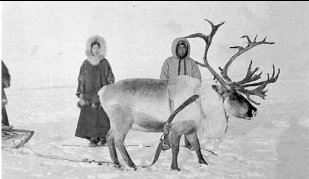
Reindeer, Alaska, 1899