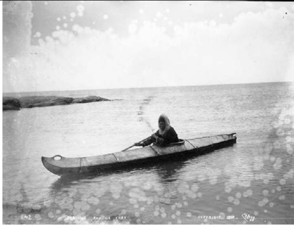
Kayak, probably Alaska, US, 1900