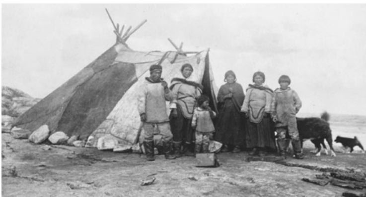
Tupic, Fort Chimo, Que. 1896