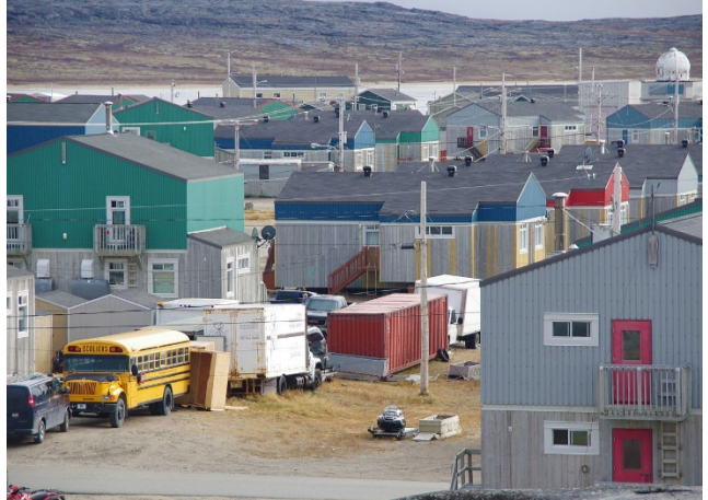
Inukjuak, Que. Oct 12, 2014