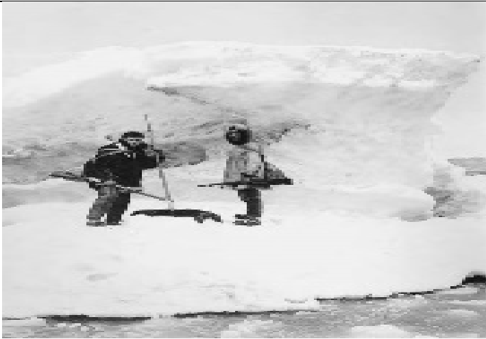
Two hunters (one Eskimo) with rifles and harpooned seal on ice floe, Seward Peninsula, circa 1908-1915