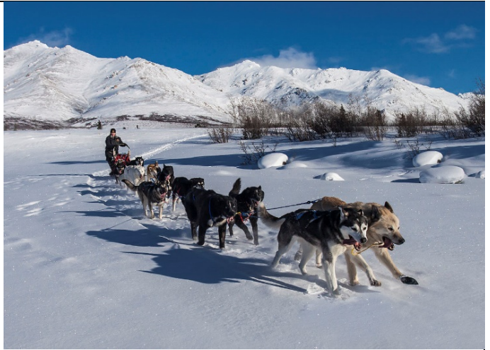
Denali National Park, Corrie Mile 9 Landscape, Alaska Feb 24, 2013