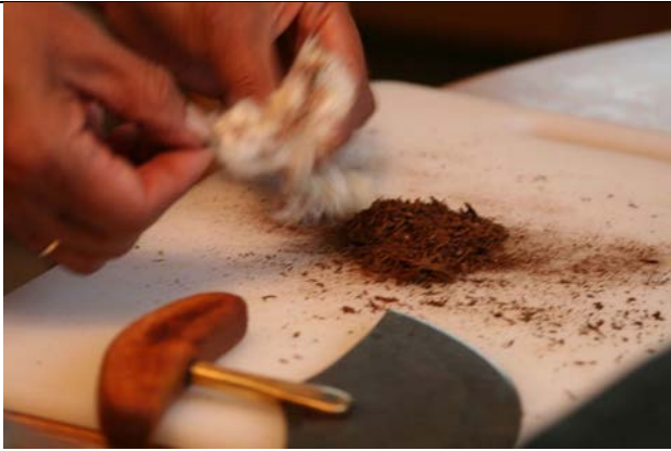
Ulu knife, Aug 1, 2009