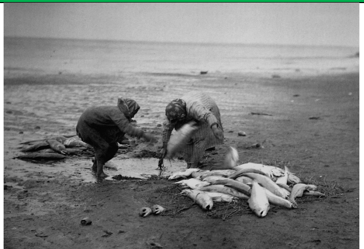
Moser, Jefferson F. (1902) Salmon Investigations of the Steamer Albatross in the Summer of 1900 , Bulletin of the United States Fish Commission, vol.21, 1901, Washington, DC : Government Printing Office, p. 186