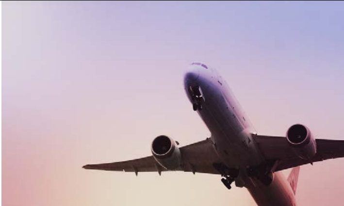
Boeing 737-200, Airplane