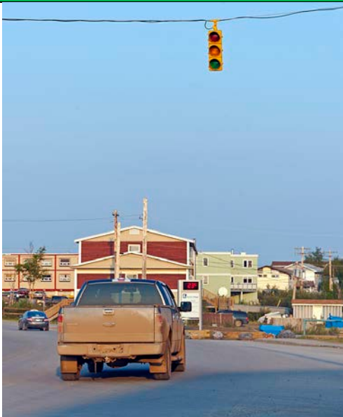
Inuvik, NT, 30 June 2015