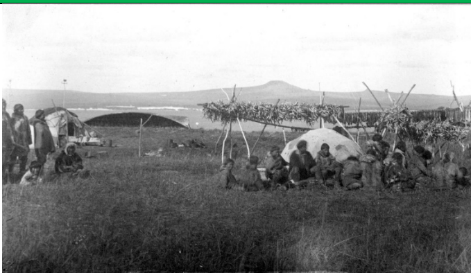
Inuit drying fish at Grantley Harbor. Seward Peninsula region, Alaska. cc 1885.