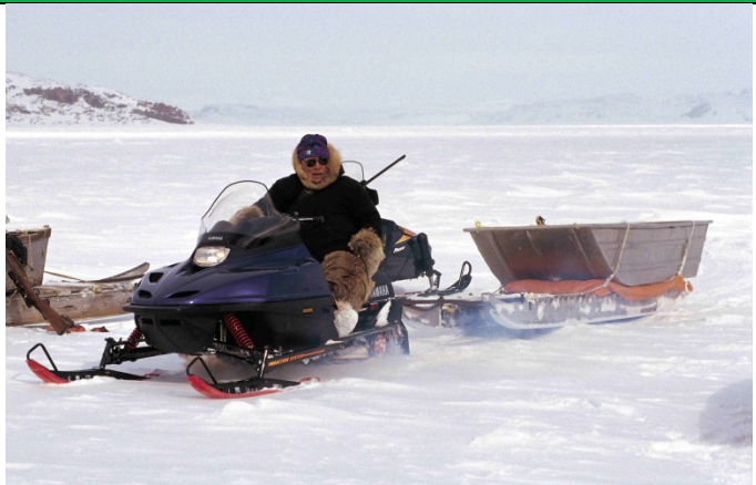
Seal hunter at the floe edge near Cape Dorset (Nunavut Territory, Canada) April 03, 1999